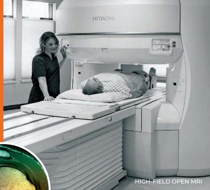
HIGH-FIELD OPEN MRI